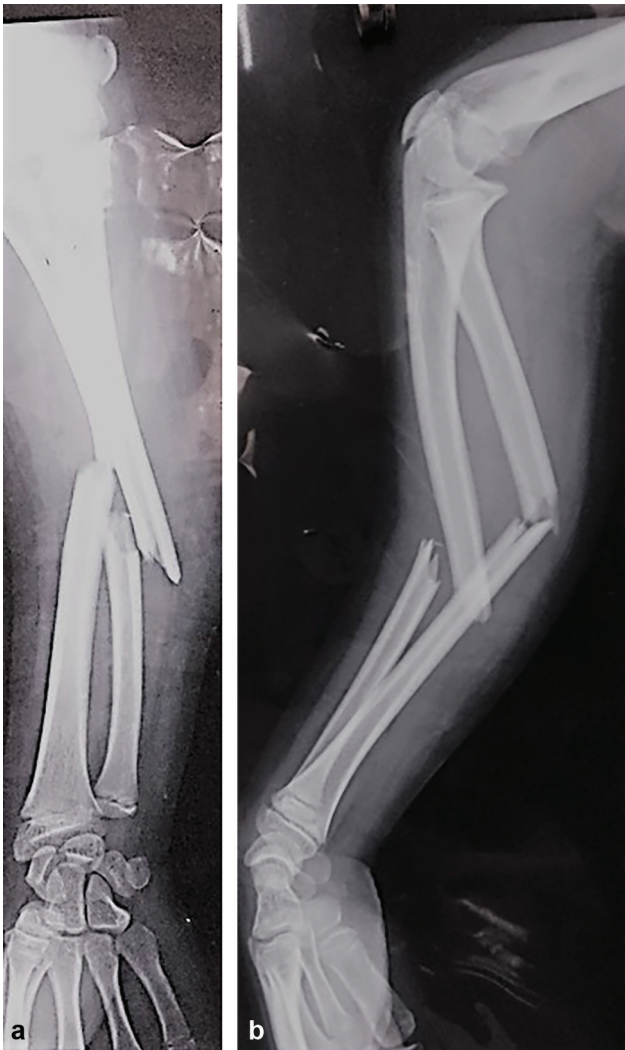
Fig. 1 (a) Anteroposterior (AP) view and 1(b) lateral view of a 10-year-old boy who sustained both bone forearm fracture of the right side.